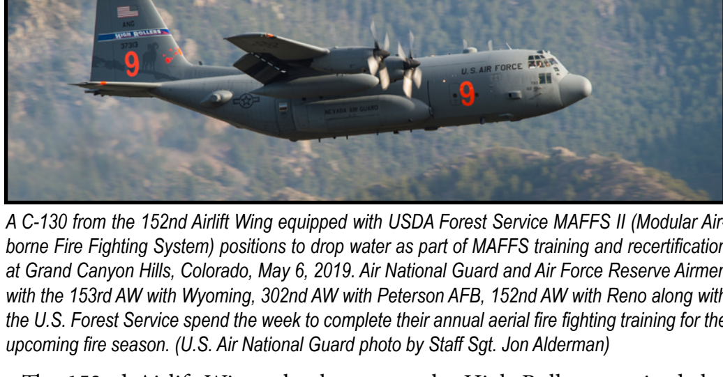
A C-130 from the 152nd Airlift Wing equipped with USDA Forest Service MAFFS II (Modular Airborne Fire Fighting System) positions to drop water as part of MAFFS training and recertification at Grand Canyon Hills, Colorado, May 6, 2019. Air National Guard and Air Force Reserve Airmen with the 153rd AW with Wyoming, 302nd AW with Peterson AFB, 152nd AW with Reno along with the U.S. Forest Service spend the week to complete their annual aerial fire fighting training for the upcoming fire season.